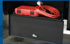
STORAGE BOX SP54-099

* Please note: the step part number does not correspond with the width of the step.