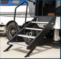
3 STEP HANDRAIL STP214-029H