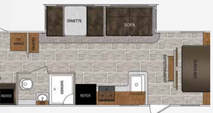
Length: 34' 6" • Height: 10' 7" • Hitch Weight: 655 lb. Unloaded Vehicle Weight (UVW): 6,288 lb. • Cargo Carrying Capacity (CCC): 1,367 lb.