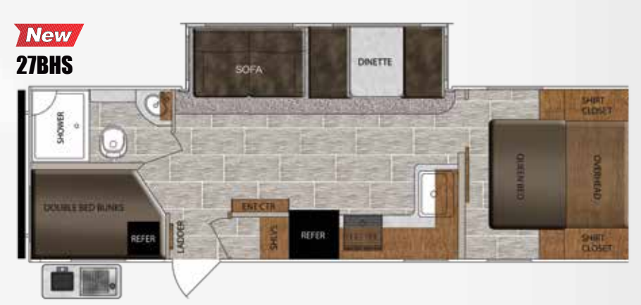
Length: 27' 11" • Height: 10' 7" • Hitch Weight: 629 lb. Unloaded Vehicle Weight (UVW): 5,248 lb. • Cargo Carrying Capacity (CCC): 2,381 lb.

Length: 31' 1" • Height: 10' 7" • Hitch Weight: 555 lb. Unloaded Vehicle Weight (UVW): 5,528 lb. • Cargo Carrying Capacity (CCC): 2,027 lb.