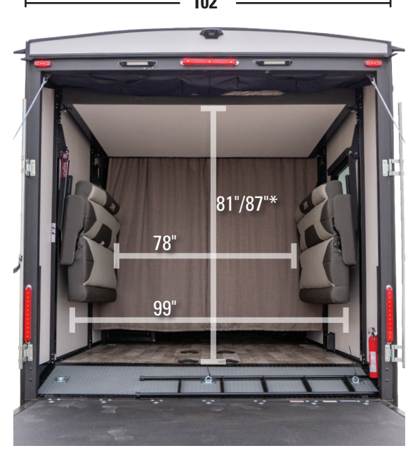
* Height from the dovetail to bottom of the bed is 81" and the height from dovetail to the 3 season door opening is 87".

Hyperlite has redefined what a Travel Trailer Toy Hauler should look and feel like. Our 2022 exteriors feature UV resistant Gel-Coated fiberglass with aluminum framing, fully enclosed "Body-Armor" underbelly, and full LED taillights to name a few. These spacious garages and interiors provide maximum space.